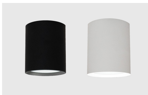
ICON 120 S