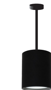
ICON 120 P